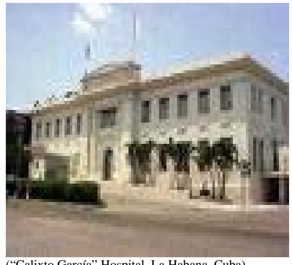
("Calixto García" Hospital, La Habana, Cuba)