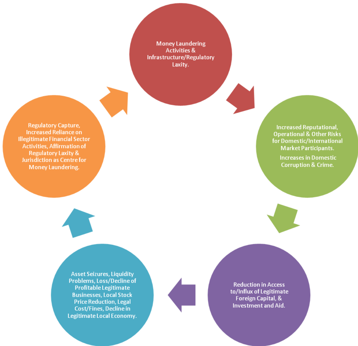
Figure 1: The Entrenchment of Money Laundering