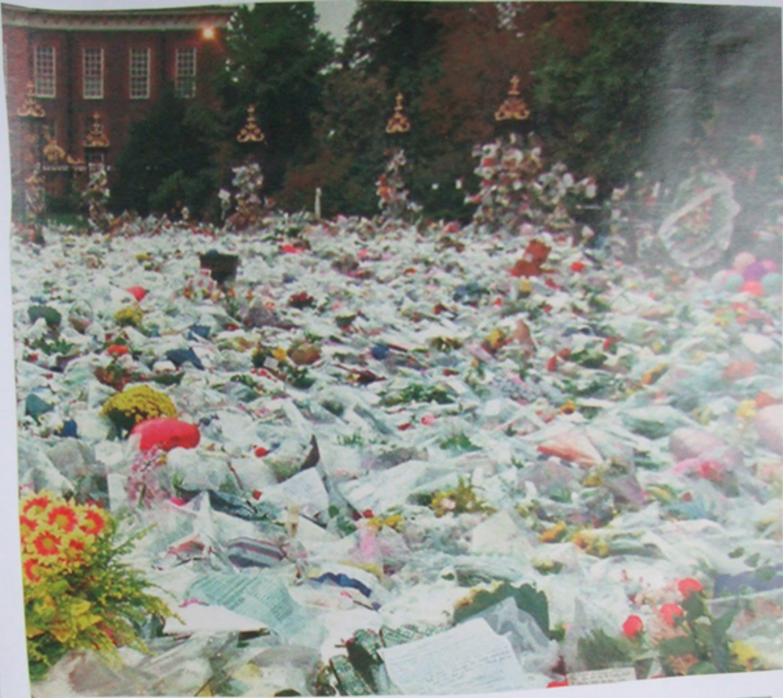
Above: A small section of the floral tributes placed outside Kensington Palace Right: The hearse moves through North London