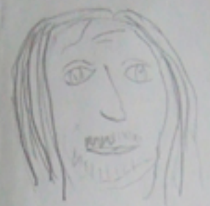
Oliver Cromwell Roundhead Parliament.