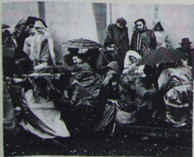
Crowds gather in the rain.