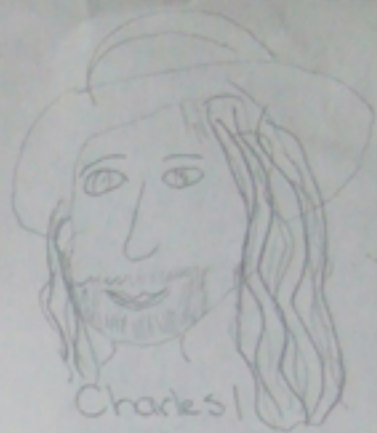
Charles I Cavalier The King