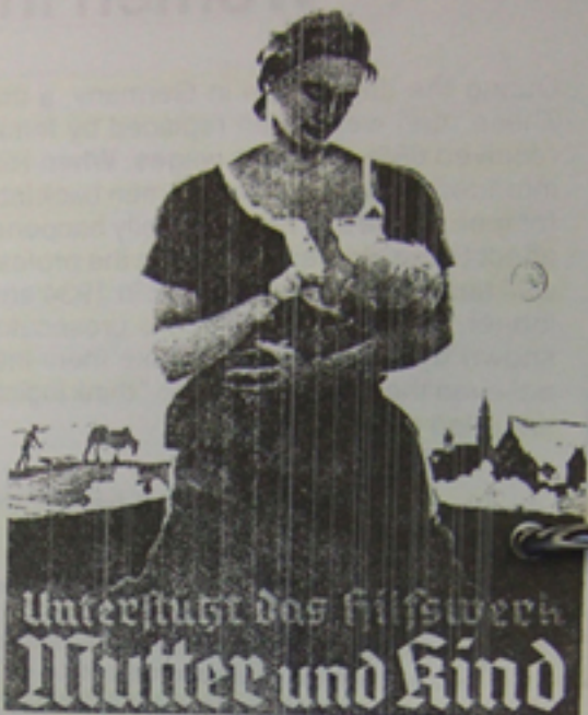
A Nazi poster of 1937 showing what Nazis thought a woman's role in life should be – a housewife and mother

The only thing that women were actively encouraged to do was to have children. Every 12 August, the birthday of Hitler's mother, the Motherhood Cross was awarded to the women who had most children.