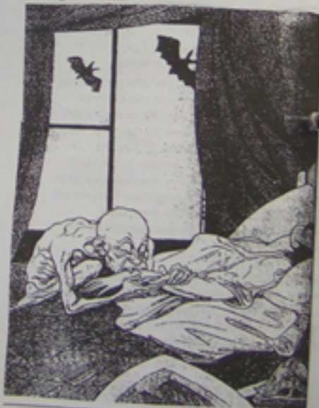
A cartoon from a German magazine in July 1919. It was called 'Clemenceau the Vampire' and shows the French premier sucking the blood from Germany.

Even so, ex-members of the Freikorps continued to cause difficulties. They formed a group called 'Organisation Consul', which in 1921 murdered Matthias Erzberger, a leading politician who agreed to the signing of the Treaty of Versailles. In 1922 the group murdered Walther Rathenau, Germany's Foreign Minister.