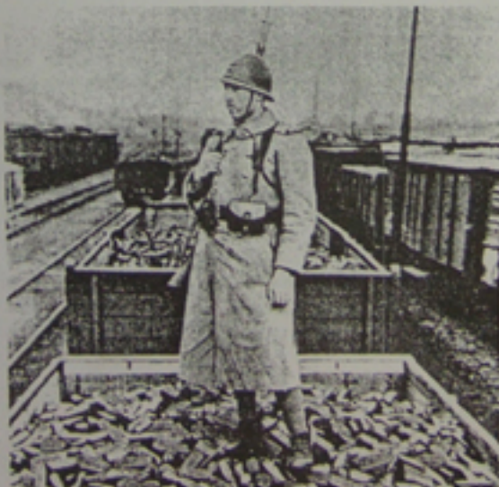
A French soldier guarding a train full of German coal from the Ruhr in 1923.