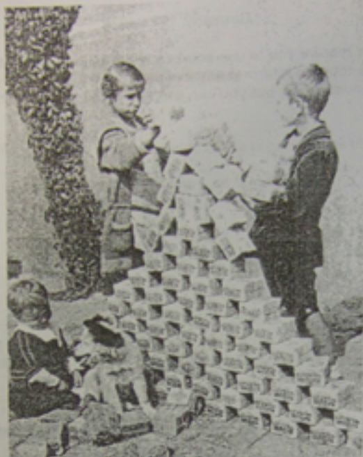
A photograph taken in 1923 of children using German banknotes as toys.