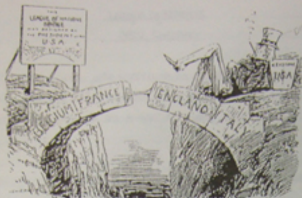
THE GAP IN THE BRIDGE

1 Look at the cartoon on the League of Nations and answer the questions which follow