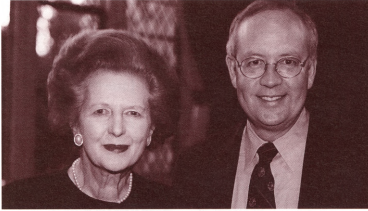
The Hon Kenneth W Starr with Baroness Thatcher, Chairman of the Advisory Council of the Institute of United States Studies, University of London

Little has been said in public by Kenneth Starr since he submitted his report to the US House of Representatives, on 9 September 1998, containing 'substantial and credible information that President William Jefferson Clinton committed acts that may constitute grounds for impeachment'. It was therefore something of a coup for London University that Mr Starr agreed to give a lecture entitled 'Ethics in Government: the Presidency and the Independent Counsel', sponsored by the Institute of United States Studies and the Institute of Advanced Legal Studies in association with the Daily Telegraph .