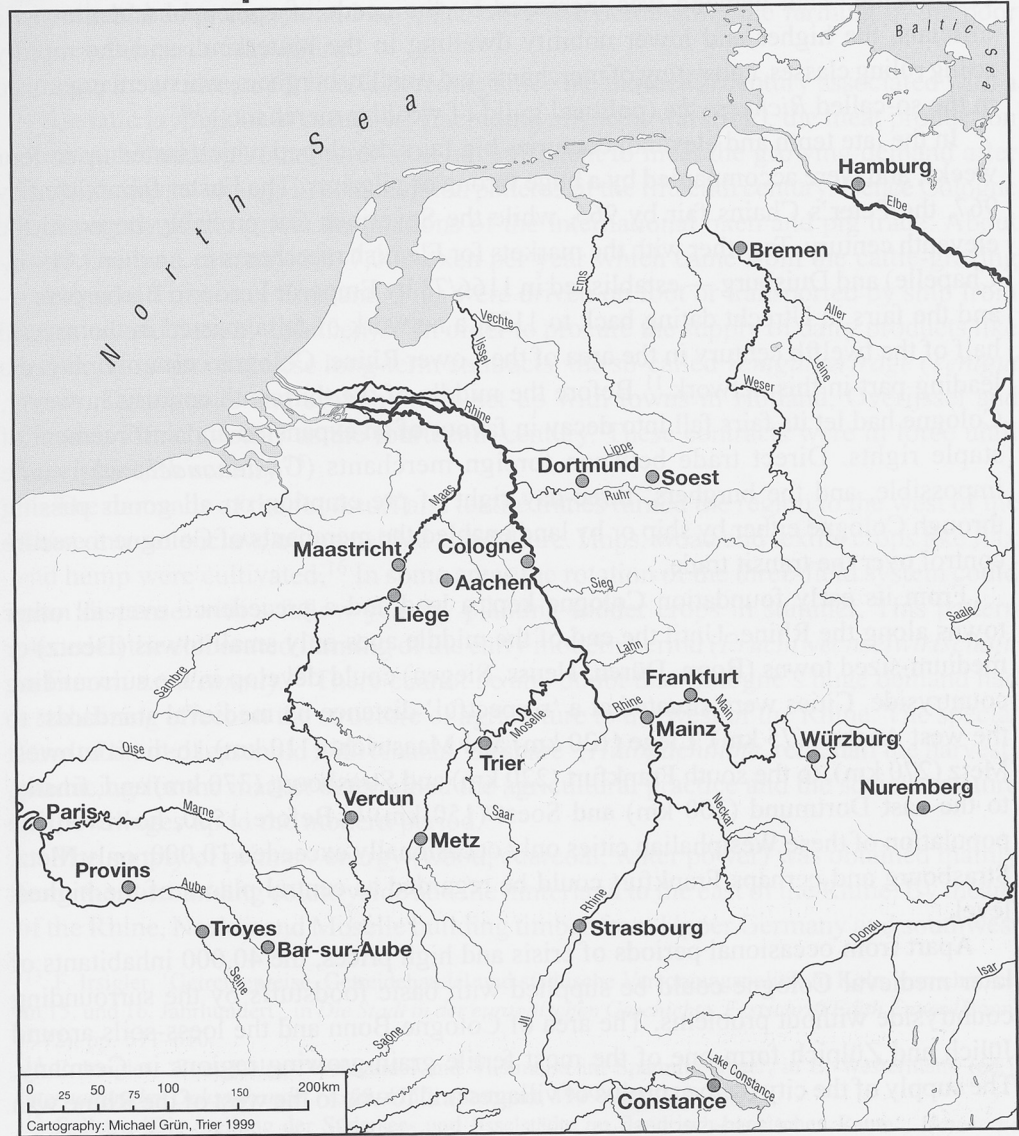
Fig. 3.1. Location map: places mentioned in the text