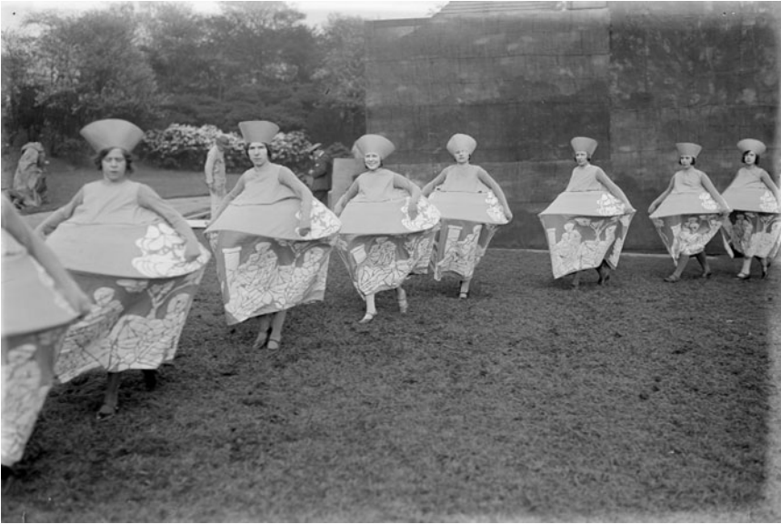
Figure 3: Women dressed as pottery during the Stoke-on-Trent Historical Pageant (1930). Staffordshire Museum Service, FP.76.41.10397 (37/22176).