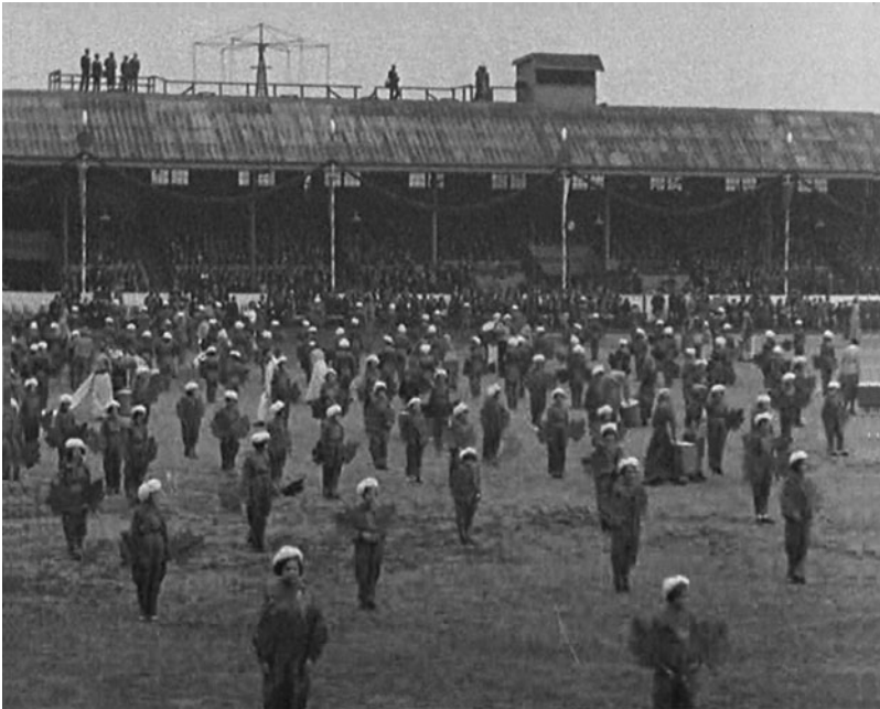
Figure 1: Children dressed as buds of cotton during the opening scene of the Lancashire Cotton Pageant 1932. British Pathé, Film ID: 679.12.

performers, commemorating the centenary of the opening of the Liverpool and Manchester Railway. 77 In 1932, Anderson hit the 'big-time' with the Lancashire Cotton Pageant, and truly began using pageantry to put the ideals of civic publicity into practice. 78 Performed 16 times in Manchester's Belle Vue gardens, the pageant had a cast of 12,000, and attracted crowds totalling 200,000. The pageant was organized by the Joint Committee of Cotton Trades' Organizations, the Lancashire Industrial Development Council and the Manchester Development Committee, and was also supported by mayors and councillors from surrounding towns and cities, such as Liverpool, Stockport and Oldham. 79 The narrative created a both allegorical (see Figure 1 ) and literal story of cotton, with scenes such as Cotton in Ancient Times, The Age of Inventions (featuring inventors such as John Kay, with his flying-shuttle) and Lancashire at Work (depicting the working-life of the mill operative). 80