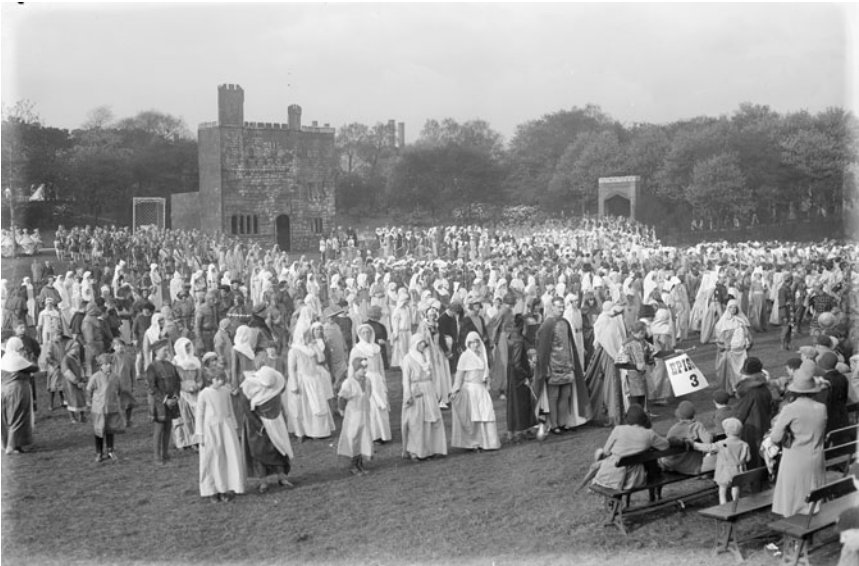
Figure 4: The performers and audience of the Stoke-on-Trent Historical Pageant (1930).