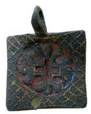
1.8 JHB 1201 (cross of Toulouse)