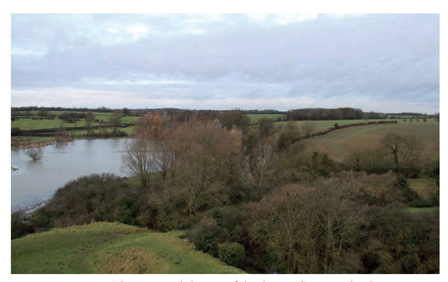
Figure 6.2 The mere and the site of the deer park at Framlingham castle, Suffolk. This 'view' from the principal castle buildings dates to the rebuilding of the castle in the late twelfth century.