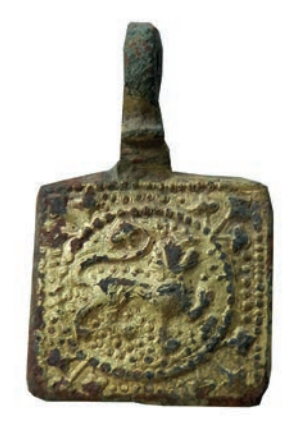
1.1 JHB 1544 (lion passant to sinister)