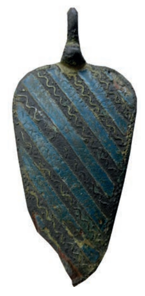
1.5 JHB 465 (bendy)