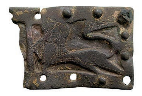
2.2 JHB 1413 (lion passant guardant)