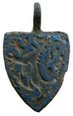
2.9 JHB 873 (billety, a lion rampant)