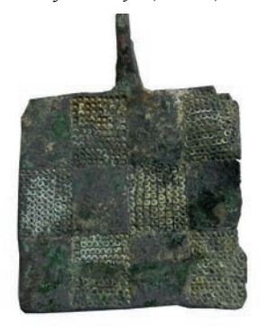
1.3 JHB 512 (chequy)