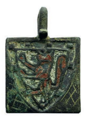
2.7 JHB 585 (Cornwall)