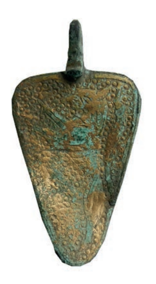
1.6 JHB 664 (lion rampant)