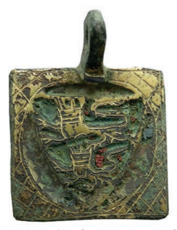
2.5 JHB 795 (two lions passant guardant)