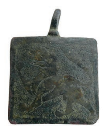
2.1 JHB 1327 (lion passant)