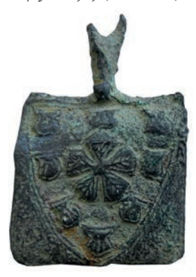
2.8 JHB 474 (FitzNicol)