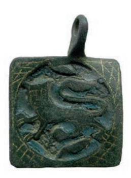
2.4 JHB 1419 (lion passant guardant)