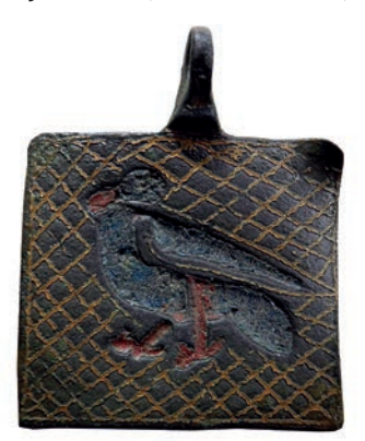
1.9 JHB 1508 (bird)