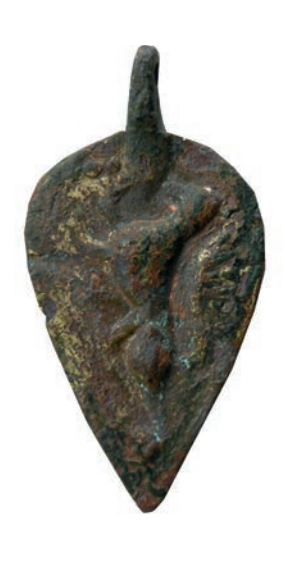
1.7 JHB 679 (lion rampant)