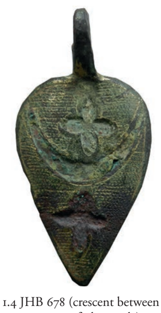
two quatrefoils in pale)