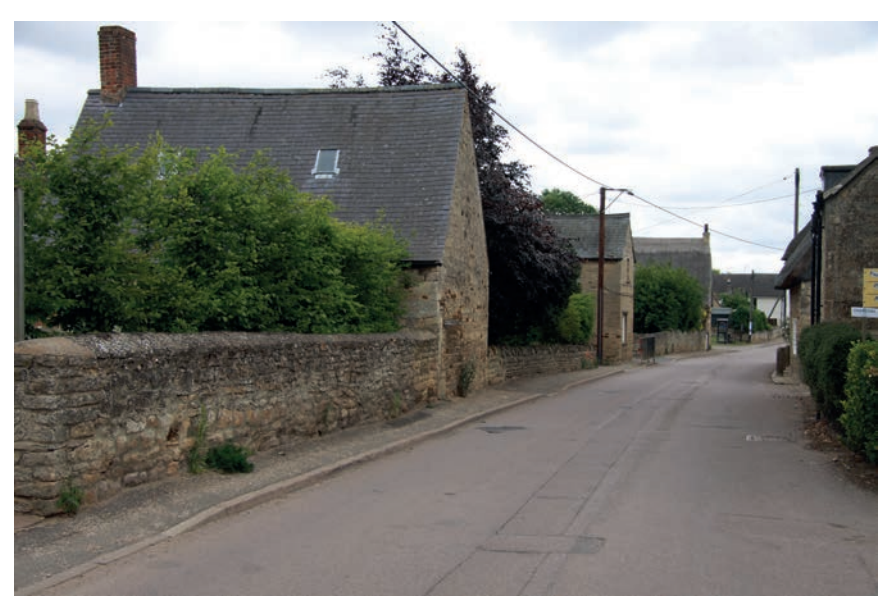
Figure 6.3 Village with regular plan at Woodnewton, Northamptonshire. The characteristic pattern of the gable ends of modern buildings facing the main street is a legacy of the medieval village expanding over its arable fields.

or continuing impoverishment.<sup>75</sup> Moreover, where is has taken place, excavation suggests that many of the north's plan row villages are twelfth century in date, that is far beyond any possible connections with the events of the Conqueror's reign.<sup>76</sup>