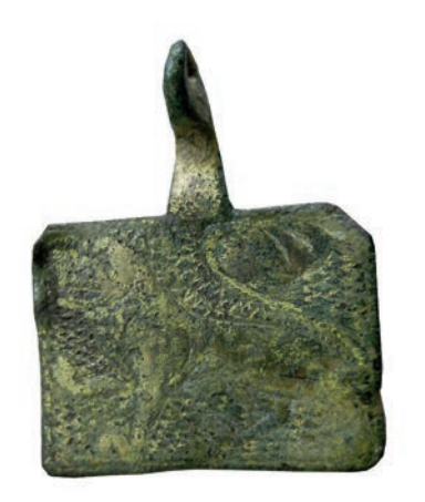
2.3 JHB 1345 (lion passant)