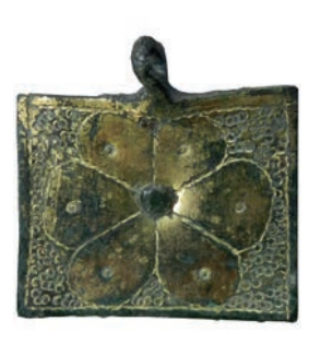
1.2 JHB 1032 (sexfoil)