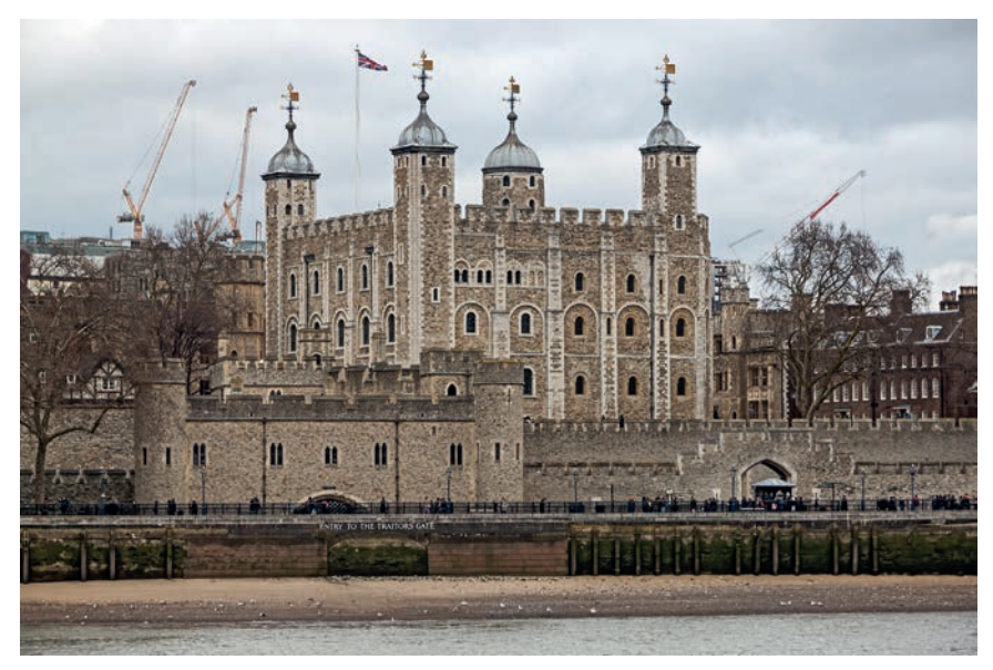
Figure 6.1 The White Tower, London. William I's tower drew inspiration from the keeps of his homeland and initiated a tradition of building in England.

and found expression in both England and Normandy up to the close of the twelfth century. The twelfth century in particular is characterized by buildings that, while made up of similar constituent parts such as halls, chambers and chapels, were also distinguished by originality and innovation in their architectural detail and complexity of access arrangements. The range of influences on the development of keeps can be seen on the one hand in 'familial' patterns where buildings deliberately reference each other, such as Norwich, Falaise and Castle Rising, whereas in other cases the desire to push the bounds of what was architecturally possible led to highly individualistic buildings, such as Rochester. This desire to innovate