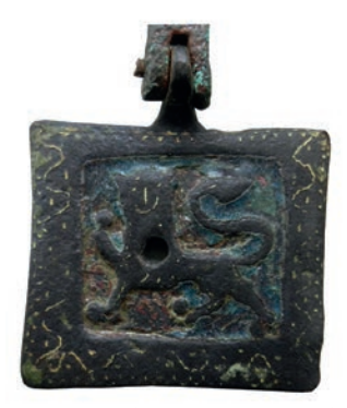
2.6 JHB 1500 (lion passant guardant)