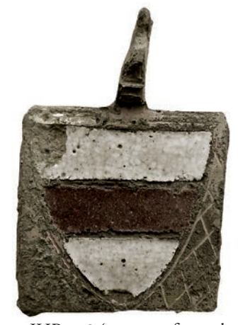
1.10 JHB 708 (argent, a fess gules)