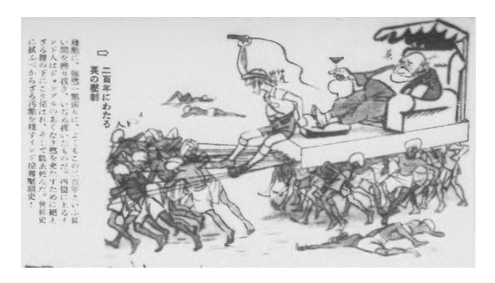
<Figure 3> Shashin Shuho No. 281, 21 July 1943.

As mentioned before, Churchill was vehemently against Indian independence, and his attitude was too imperialistic even in his own time. In Japan, Churchill was often used to symbolize Indian coercion. In the context of the liberation of Asia, he could not be a leader representing the free world.