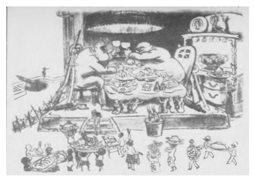
<Figure 1> Shashin Shuho No. 294, 20 October 1943

African soldier, with a whip on his left arm. His famous cigar is drawn to make him look like a gangster, and his nice John Bull-esque clothes are contrasted with the soldier's bare feet. By depicting crosses with skulls, it made up the image of the British Empire or western culture as a tomb of African people. The themes of this picture are inequality and false masculinity.