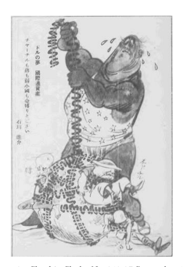
<Figure 6> Shashin Shuho No. 340, 27 September 1944.