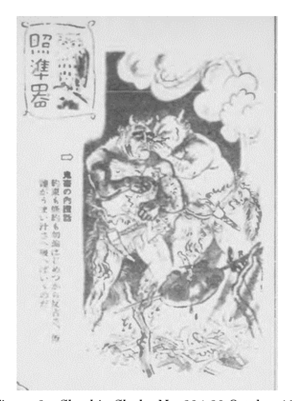
<Figure 2> Shashin Shuho No. 294, 20 October 1943

was built upon naked coloured people, and indicates that Anglo-American superiority was attained at the expense of their colonies. An artillery gun was drawn next to Roosevelt and implies how violent they were in order to seize power over colonies, and destroy natives' lives. By depicting those two leaders ominously, it emphasized the cruelty of Britain and America.