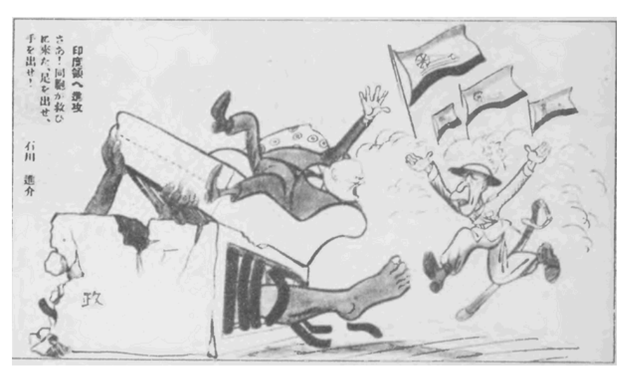
<Figure 4> Shashin Shuho No. 317, 19 April 1944.

Fig. 4 is a caricature of the Indian liberation from Britain. 88 Churchill is sitting on the couch of India, but overturned by the Indian, who has been imprisoned in the base of the chair. The caption says that 'now that your fellow beings came to save you, let's spread your arms and legs'. The man running away from Indian flags is Lord Mountbatten, who was the Supreme Allied Commander, South East Asia Command (1943-6).89 It implies that with Japanese help, India could liberate herself from British rule. Visual propaganda distributed in Japan focused on British colonial history, and aimed to legitimize the ultimate Japanese war objective of Asian freedom. Japan found the best emblem of Western arrogance in Churchill, due to his late-Victorian imperialism.