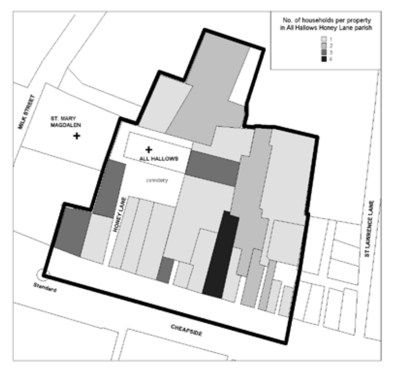
Fig. 3. Map showing density of households in the parish of All Hallows Honey Lane, 1660s

pursuing the post-Fire inhabitants lists in such detail and quantity has been the information that these provide for residence in the parishes. The archives of the Mercers' Company have proved particularly fruitful, with numerous leases and deeds of Company properties in the Cheapside area, and a number of eighteenth-century property and street plans proving extremely useful in tracking the transmission of properties and their physical context. In terms of archival retrieval, the 'PiP project photograph hoard' stands at 2,127 images of sources, 1,014 of which have come from material held by the Mercers' Company.